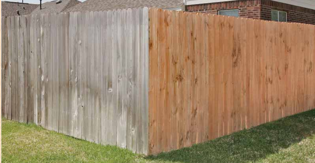
Above is a photo of an actual fence installation in Tomball, TX. The fencing on the left is cedar. On the right is ProWood Micro with MicroShades. The two were put up within 30 days of one another, 15 months before the photograph was taken.